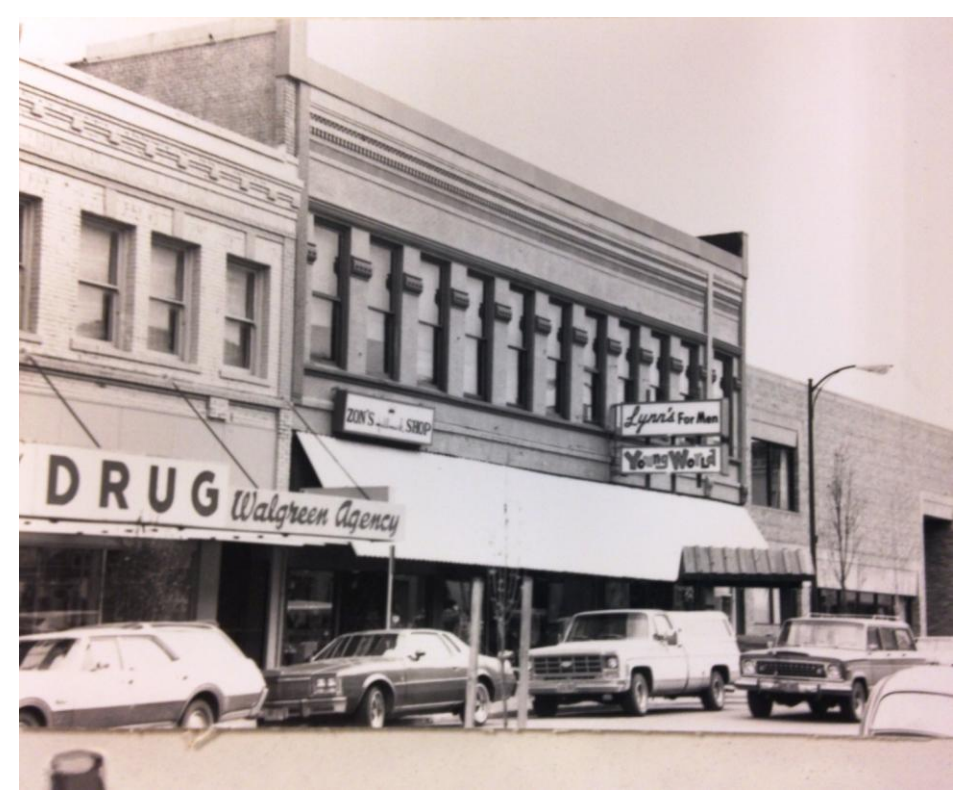
Original 1983 Survey Photo