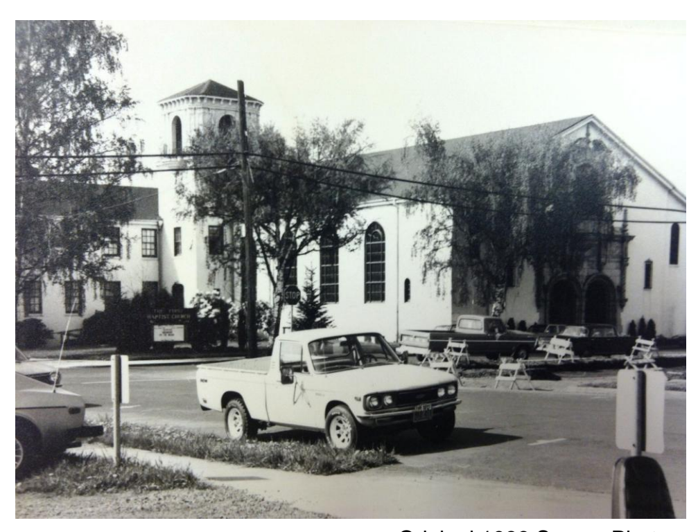
Original 1983 Survey Photo