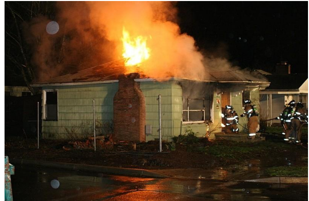
The qualifications for Deputy Fire MARSHAL