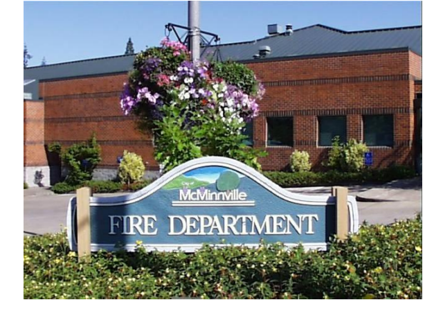
Primary Responsibilities of the Deputy Fire Marshal

The Deputy Fire Marshal assists with development, implementation, and maintenance of Fire & Life Safety education programs for youths and adults. The person in this position maintains effective working relationships with other fire service agencies, City departments, special interest groups, media representatives, and the general public regarding fire protection, Fire & Life Safety legislation, hazardous materials, and other related department operations. The Deputy Fire Marshal conducts investigations to determine cause, origin, and circumstances of fire and unauthorized release of hazardous materials; and is able to prepare clear, understandable technical and non-technical summations of inspections and Fire & Life Safety matters.