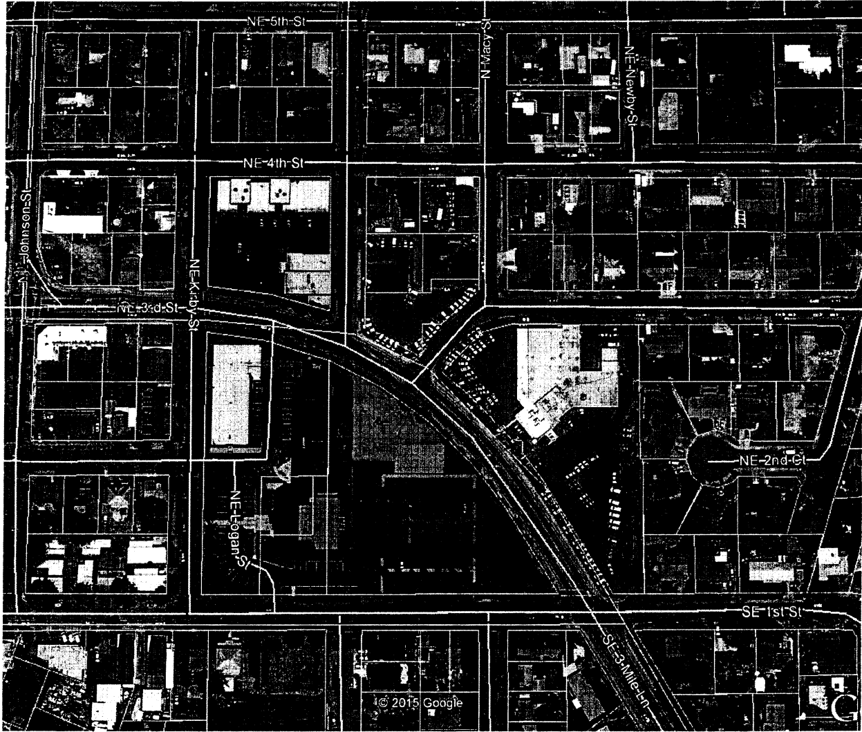
(As depicted by the shaded area)