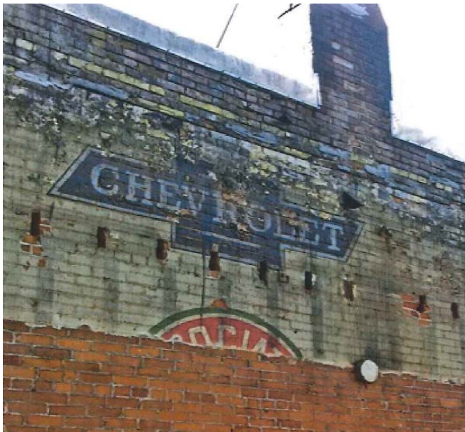
Original stucco sign remnants

The new mural images (right) were researched to depict an accurate representation of the period advertising for the then adjacent Chevrolet garage where the new building is located.