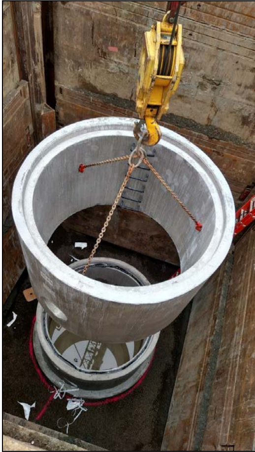
3-mile #3 pump station wet well installation

Sanitary Sewer Improvements Constructed. The City continued to invest in upgrades to the public sanitary sewer system in 2017. Work included the replacement of the 1970's vintage 3-mile Lane #3 pump station at a cost of approximately $700,000. Additionally, work to remove unwanted storm water and groundwater (inflow and infiltration) from the sanitary sewer system near Riverside Drive was completed. Over 2,700 lineal feet of sanitary sewer pipes were lined at a cost of approximately $100,000.