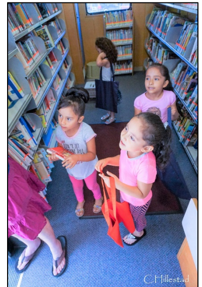
Book Buddies Bookmobile Program

New collections of games and puzzles have been very popular for borrowing to use at home and for use in the library.