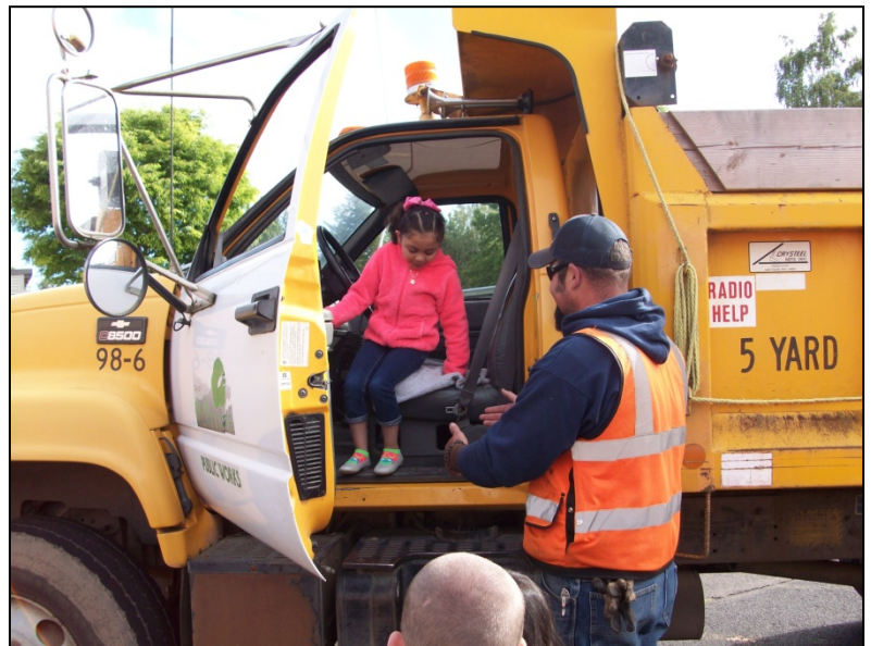
2017 National Public Works Week “touch a truck” event

National Public Works Week Celebration. City staff conducted the 10 th annual Public Works Week “touch a truck” event at three local elementary schools. The program is done in partnership with McMinnville Water and Light, Public Works, Wastewater Services and Engineering staff members who all participate in the planning of the program as well as the on-site activities each year. This year’s program included outreach to the kindergarten classes at Newby Elementary, Columbus Elementary, and Grandhaven Elementary schools.