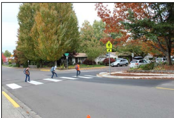
Michelbook Lane crossing improvements near Newby Elementary School

These improvements are part of the $24-million transportation bond measure approved by the voters in 2014. Thank you voters of McMinnville!