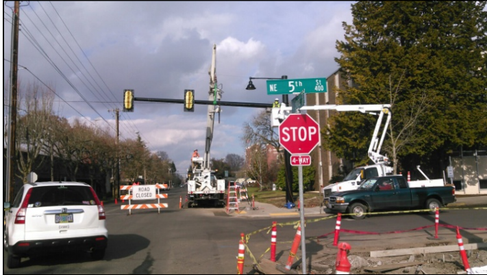
5 th Street Improvements Project traffic signal work

Transportation Bond Work Continues. During the summer, approximately four miles of City streets were repaired and repaved at a cost of $1.4 million. Additionally, the $2.6-million NE 5 th Street Improvements Project was completed. The purpose of the 5 th Street project is to improve traffic flow in the City's core and enhance roadway and pedestrian safety.