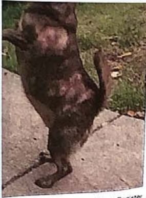
ats — maybe too much, he said

The Newberg man subsequently met the small brown dog and they've been best friends ever since.