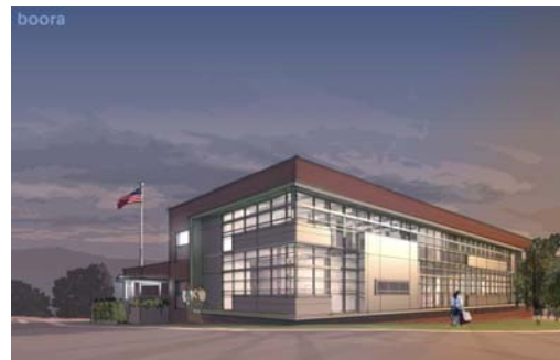
Proposed Public Safety Building

2000's Numerous office reconfigurations to provide more efficient work spaces.