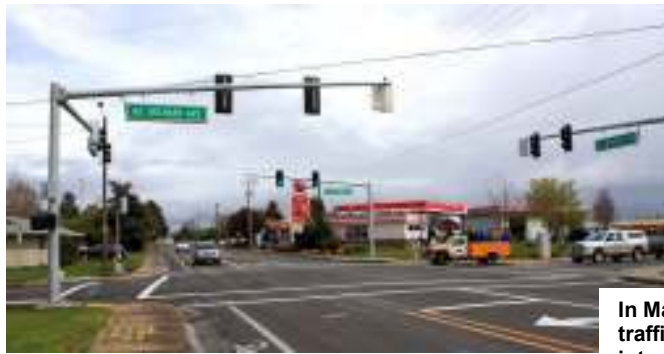
In March of 2010 the new traffic signal at the intersection of Lafayette Avenue / Orchard Avenue was energized, greatly improving the traffic flow at that location.

Also included in the budget proposal are professional services funds of $18,000, for the City's continued support of the efforts to construct the Newberg – Dundee bypass project.