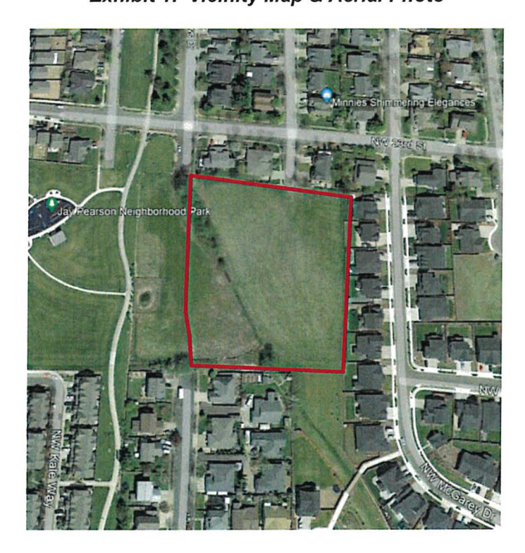
Exhibit 1. Vicinity Map & Aerial Photo

The subject property and properties to the north, east, and west, are zoned R-1, and property to the south is zoned R-2. Although the actual sizes of adjacent lots in the R-1 zone range from 4,600 to 6,400 square feet. The average lots proposed in this subdivision range between 5,436 at the smallest and 8,363 square feet at the largest. The proposed lot sizes are similar to the adjacent lots. See Exhibit 2. The predominant surrounding uses are single-family homes and duplexes to the north, single-family homes to the east and south, and Jay Pearson Neighborhood Park to the west. The subject property is currently vacant with a natural drainageway generally running north to south on the property. Most lots would access off the proposed extension of Fendle Way, and six of the lots would access directly off of Meadows Drive.