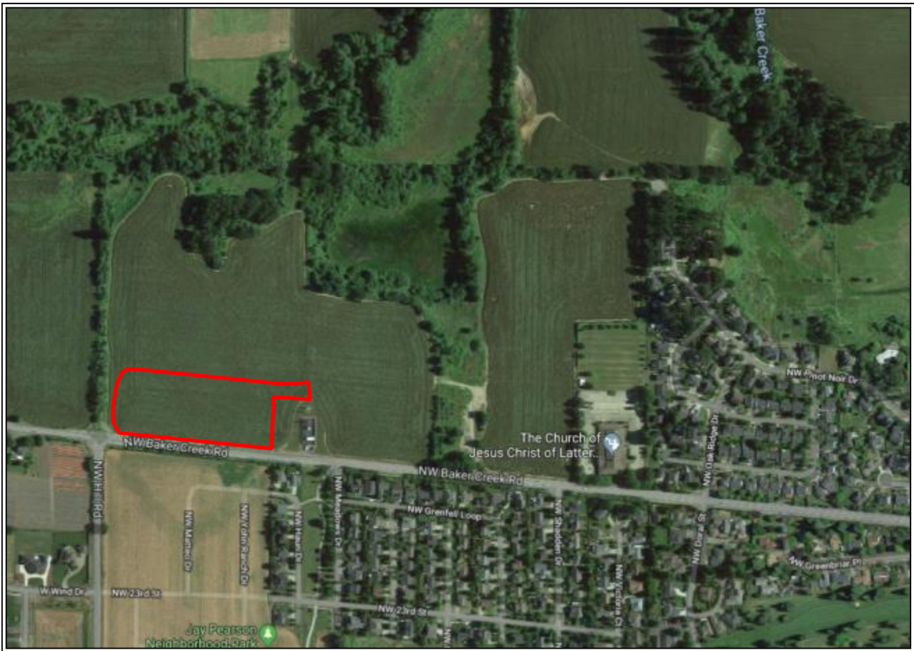
Figure 1. Vicinity Map (Subject Site Area Approximate)