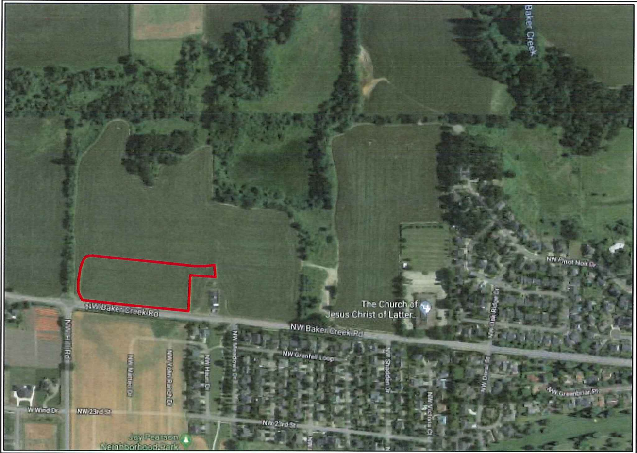
Figure 1. Vicinity Map (Subject Site Area Approximate)