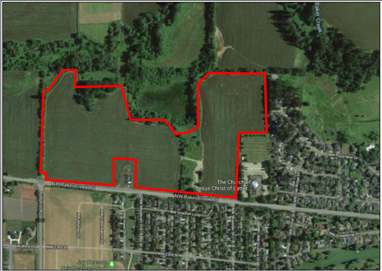
Figure 1. Vicinity Map (Subject Site Area Approximate)