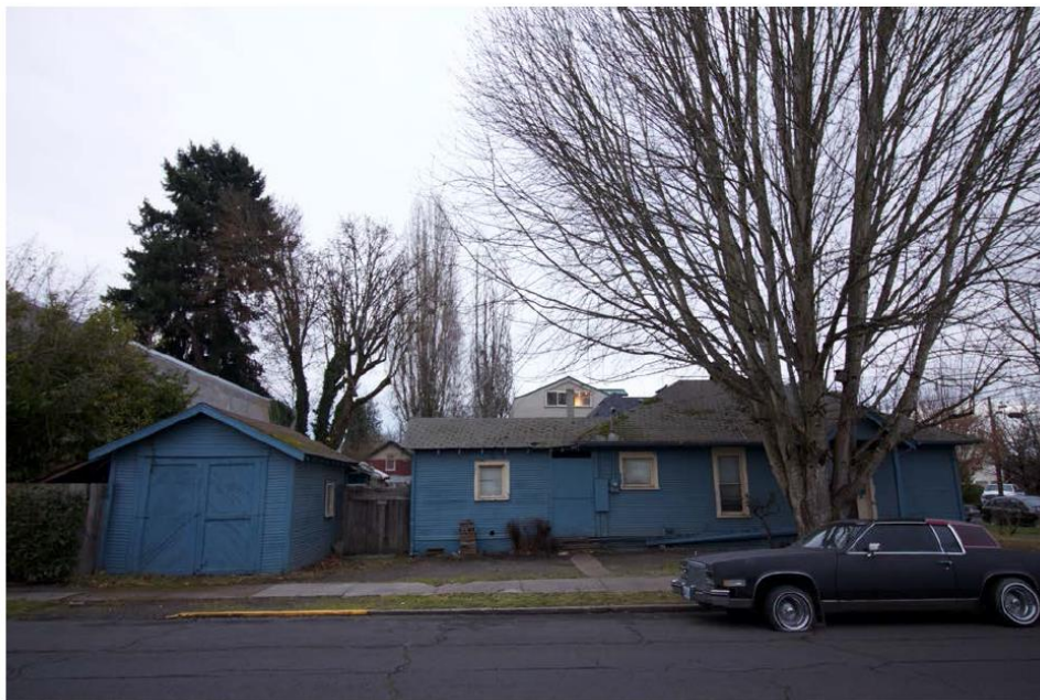
Exterior from Irvine