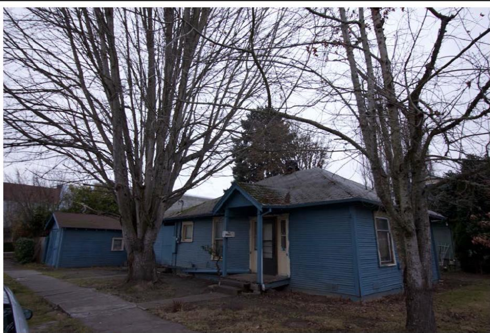
Exterior from 4th and Irvine