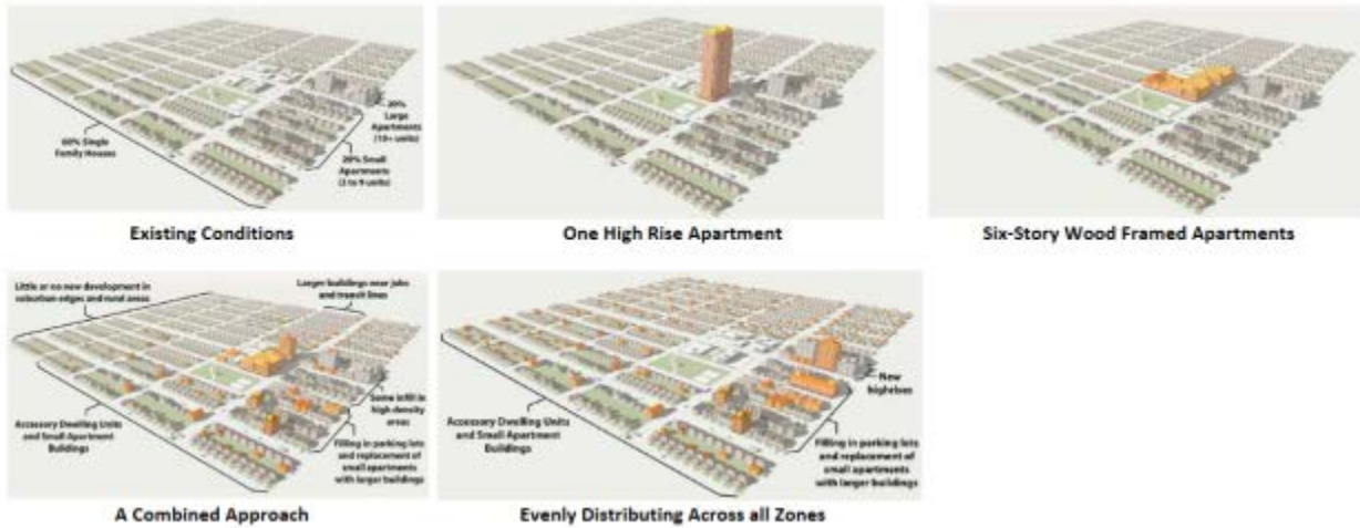
Exhibit 4. Spatial models of housing density

Provision of housing is accomplished by a wide variety of organizations including the City, builders, housing providers, and other organizations. Municipalities must fulfill certain requirements under state law and can choose to undertake additional roles to help achieve development of needed housing.