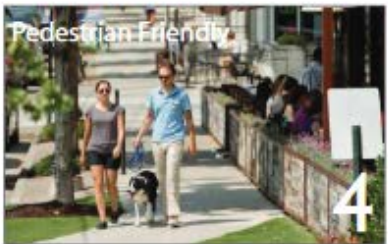
Great Neighborhoods are pedestrian friendly for people of all ages and abilities.