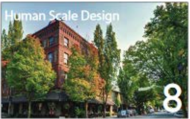
Great Neighborhoods have buildings and spaces that are designed to be comfortable at a human scale and that foster human interaction within the built environment.