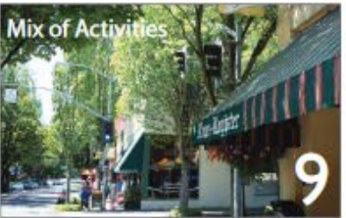
Great Neighborhoods provide easy and convenient access to many of the destinations, activities, and local services that residents use on a daily basis.