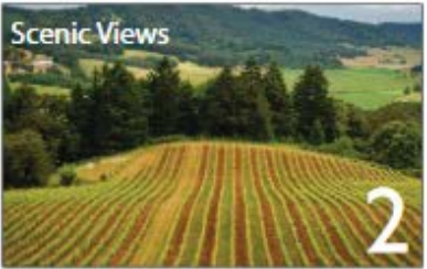
Great Neighborhoods preserve scenic views in areas that everyone can access.