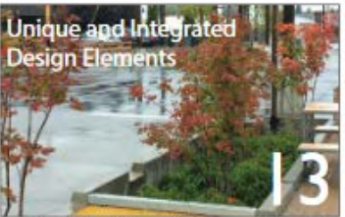
Great Neighborhoods have unique features, designs, and focal points to create neighborhood character and identity.