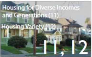
11 - Great Neighborhoods provide housing opportunities for people and families in all stages of life. 12 - Great Neighborhoods have a variety of building forms and architectural variety to avoid monoculture design.