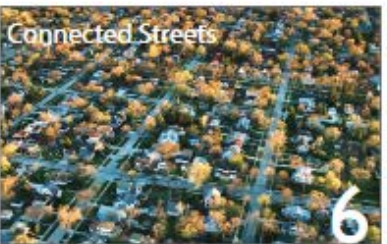
Great Neighborhoods have interconnected streets that provide safe travel route options, increased connectivity between places and destinations, and easy pedestrian and bike use.