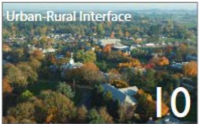
Great Neighborhoods complement adjacent rural areas and transition between urban and rural uses.