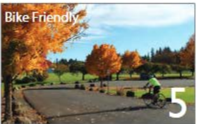
Great Neighborhoods are bike friendly for people of all ages and abilities.