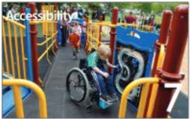
Great Neighborhoods are designed to be accessible and allow for ease of use for people of all ages and abilities.