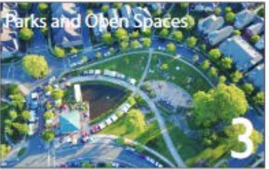
Great Neighborhoods have open and recreational spaces to walk, play, gather, and commune as a neighborhood.