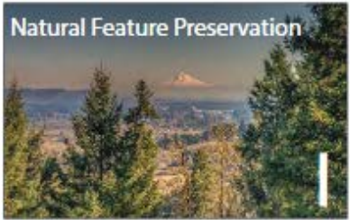
Great Neighborhoods are sensitive to the natural conditions and features of the land.

McMinnville’s Great Neighborhood Principles will guide land use patterns, design, and development of the places where McMinnville citizens live, work, and play.