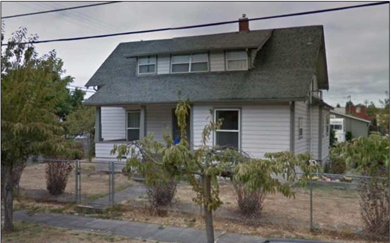
PHOTO OF HISTORIC RESOURCE (EAST ELEVATION AS SEEN FROM JOHNSON STREET):