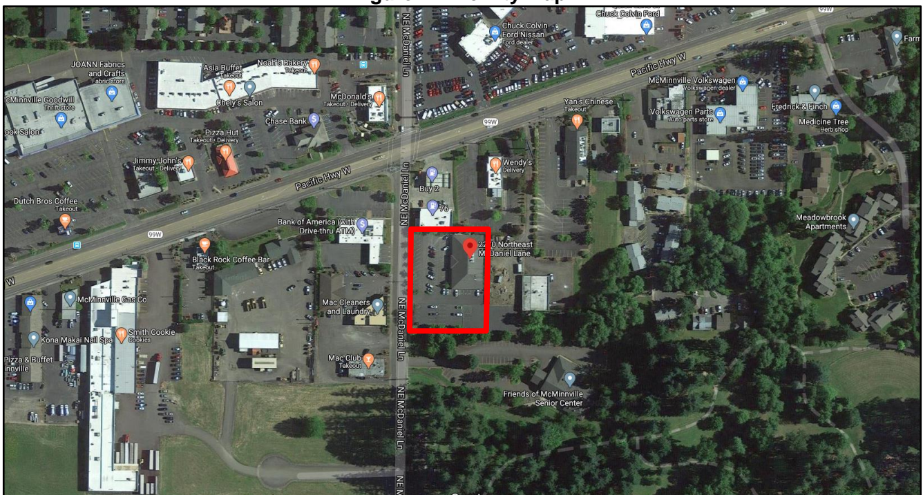
Figure 1: Vicinity Map

See Vicinity Map (Figure 1), Zoning Map (Figure 2), and Applicant’s Proposed Site Plan (Figure 3) below.