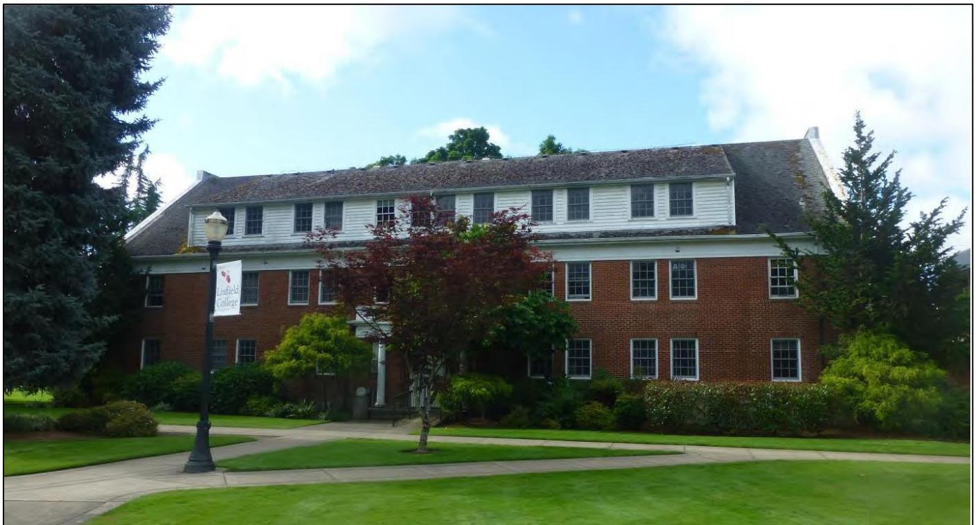
PHOTO OF HISTORIC LANDMARK (NORTH ELEVATION AS SEEN FROM LINFIELD QUAD):