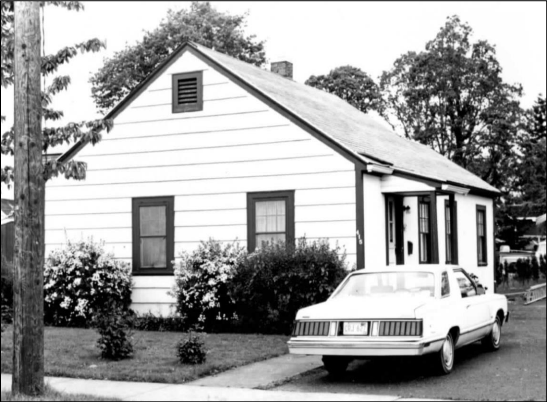
Figure 3. 1983 Historic Resources Inventory Photo – 423 SE College Ave