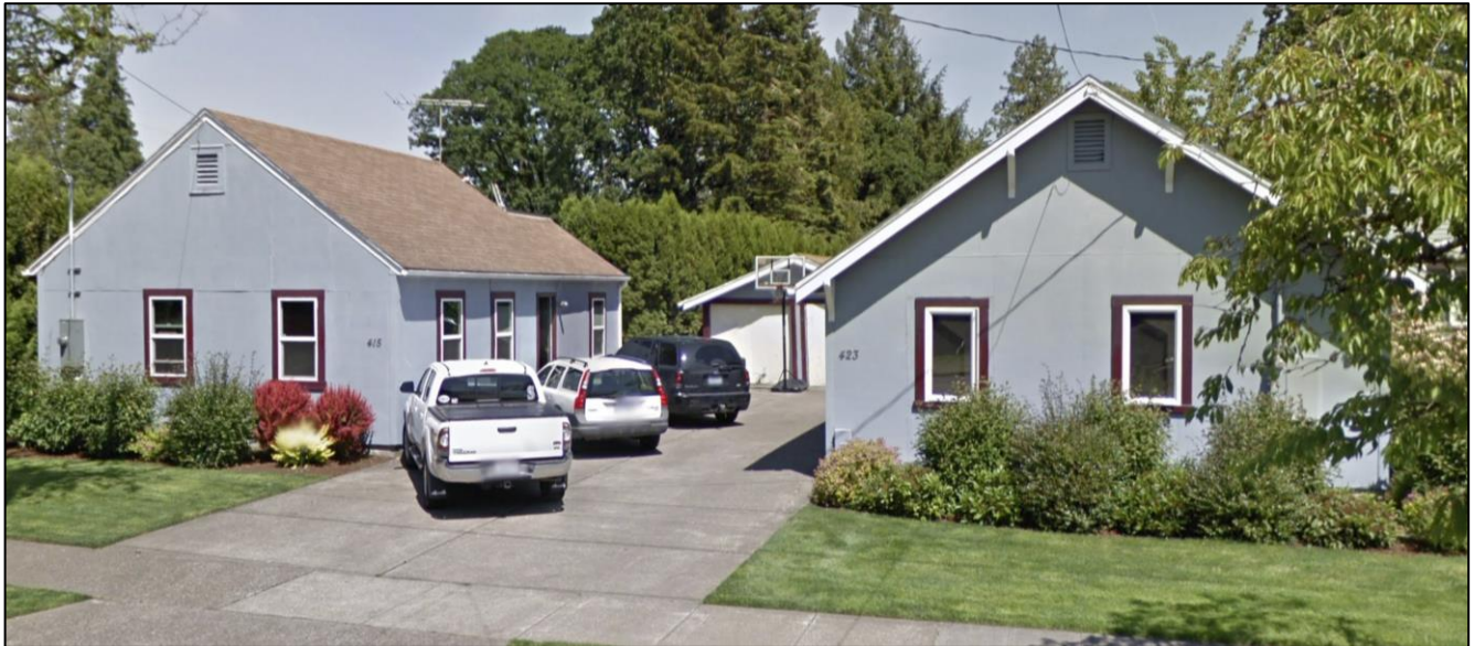
Figure 5. Proposed New Construction