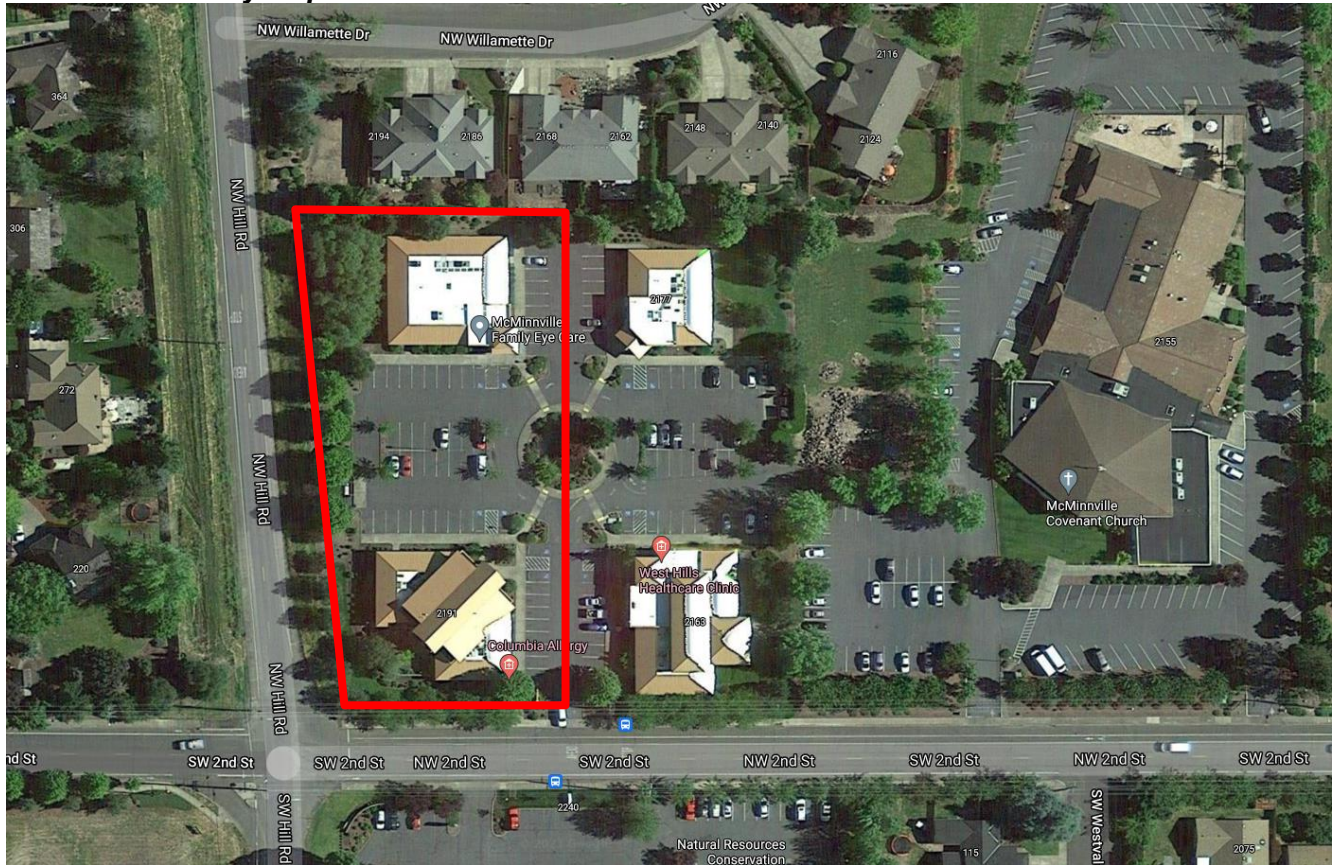
Exhibit 2. Zoning Map