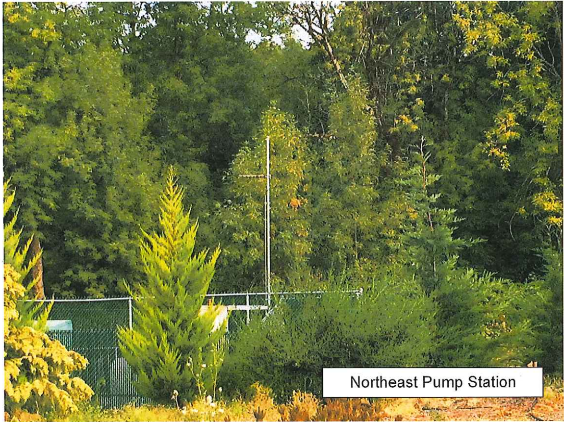
Northeast Pump Station