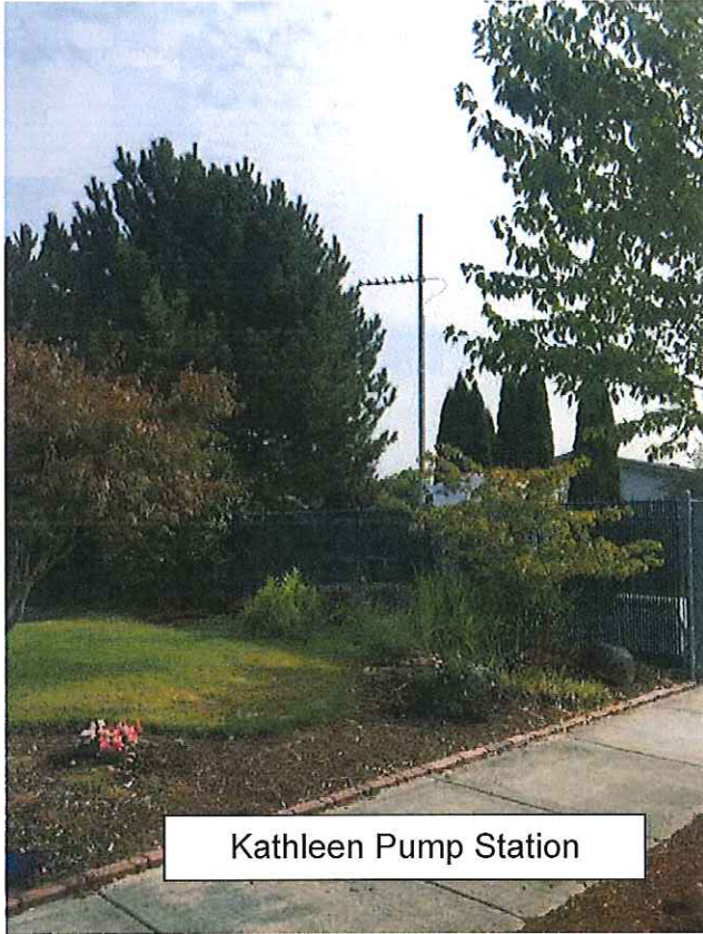
Kathleen Pump Station