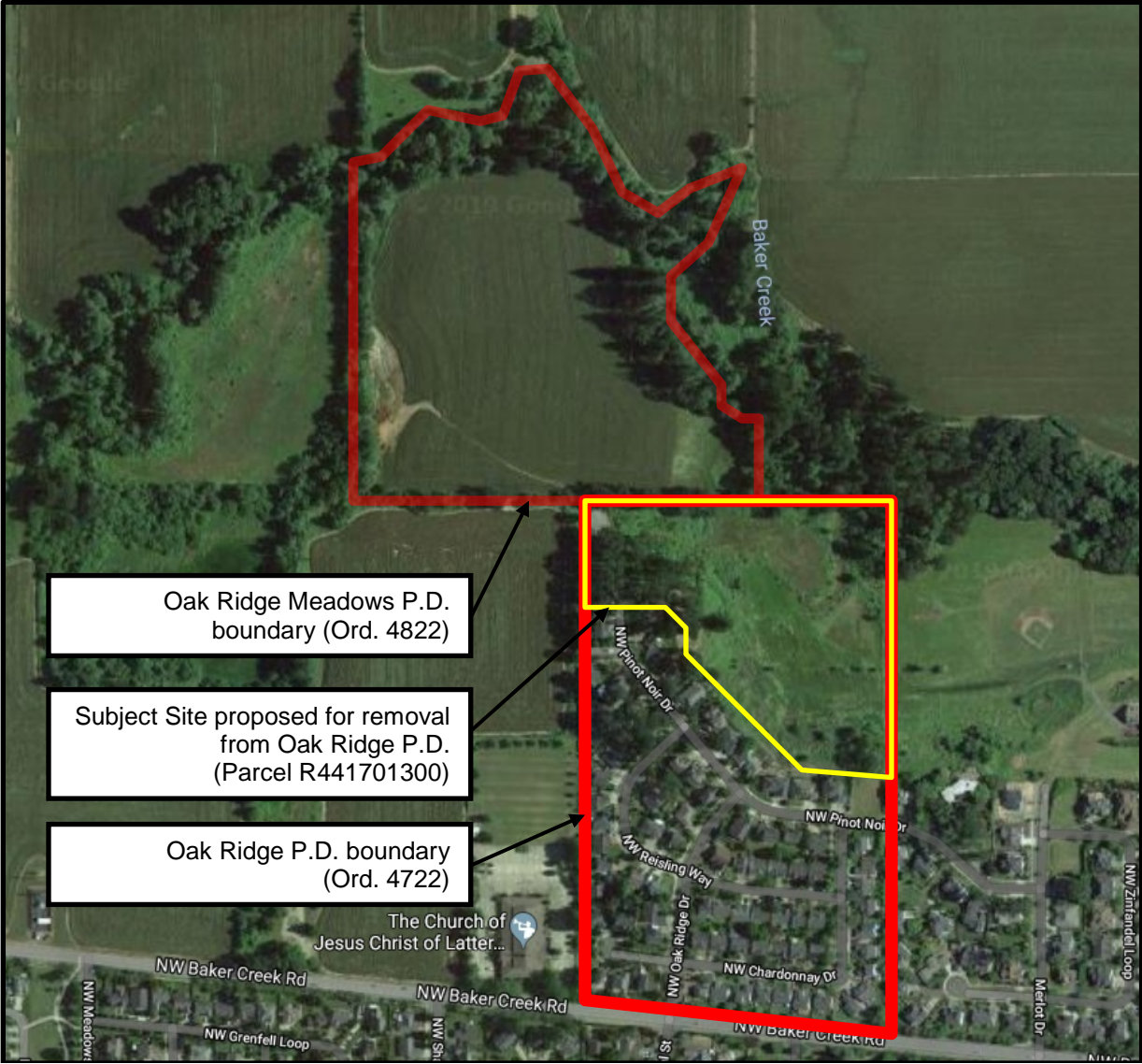
Figure 1. Vicinity Map

found generally level ground at many locations near the site's edge. Slopes within the site vary from near one percent in the central interior, to a 15 percent slope along the west boundary, and slopes ranging from between approximately 20 to 40 percent along the north and east edges. The southern portion of the site, generally north and east of Oak Ridge 1st Addition and Oak Ridge 2nd Addition, exhibits slopes also reaching up to approximately 40 percent in some locations. There are no structures or other improvements on this site. While Oak trees are the most prevalent tree type found on the site, Fir, Cottonwood and Ash trees are also present. Most of the tree cover exists along the steeper banks of the site's perimeter in addition to a fairly defined smaller area located directly north of Oak Ridge 2nd Addition subdivision.